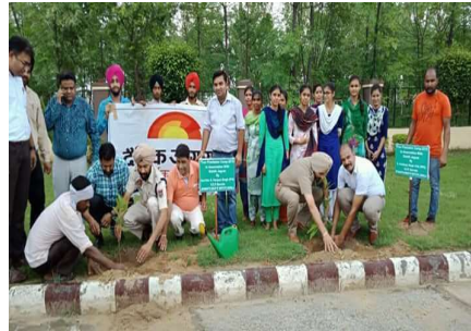
Swachh Bharat Mission Implementation photos/ news